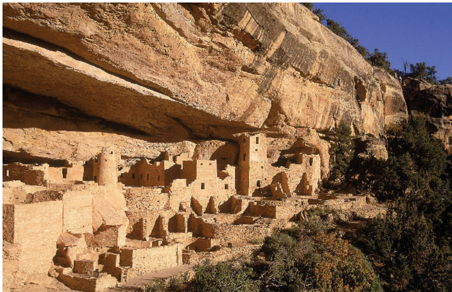
Computer simulations probe how the Anasazi culture spread in the American southwest.

It would be grossly unfair to suggest that this describes everything that happens in eco-